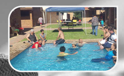
Rooms, Deco & Entertainment